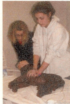
Pet Aid at Albany Obedience